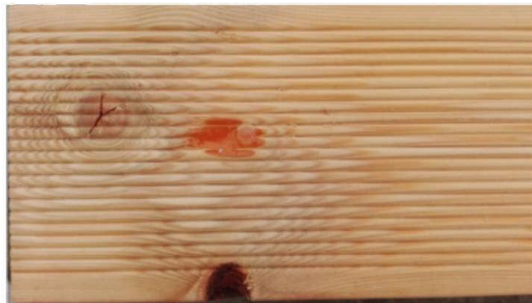
The example of a resin pocket and a knot hole