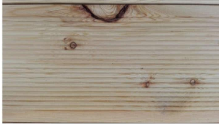
The example of a falling out lateral knot