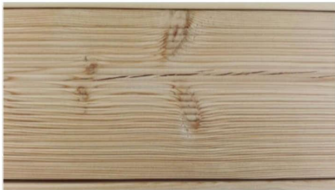
The example of a crack