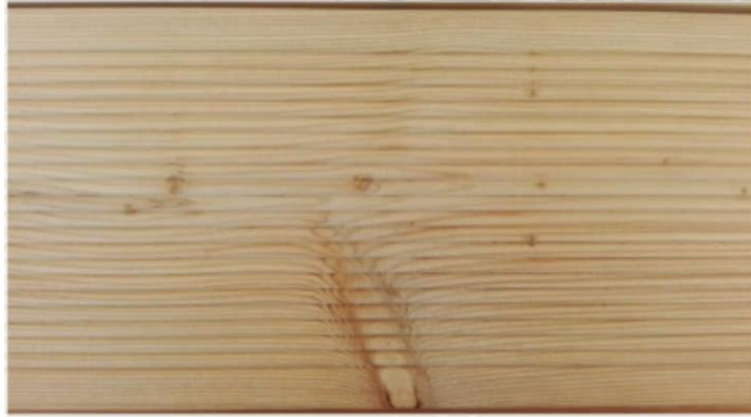
The example of a cross-cut knot