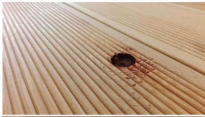
The example of a fallen out knot